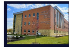
District 21 Community Service Center & Administrative Office Tel. 847-537-8270